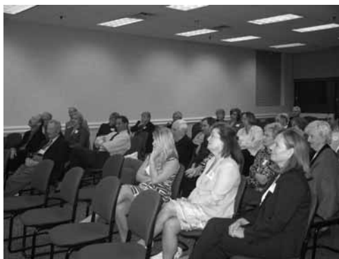
Founders Circle event attendees

The CFC is very grateful for the generous financial support and ongoing commitment provided by members of