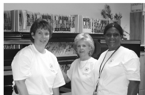
Volunteers from State Farm Insurance for United Way Day of Caring